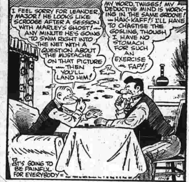
What's To Do? BY V. T. HAMLIN