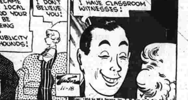
BY PETER HOFFMAN