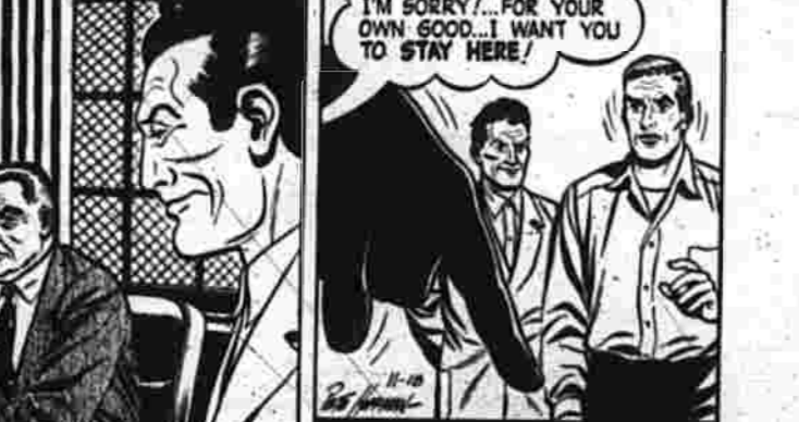
BY LESLIE LURNER