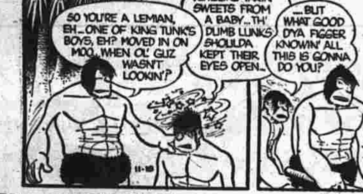
BOY AND HIS FRIENDS